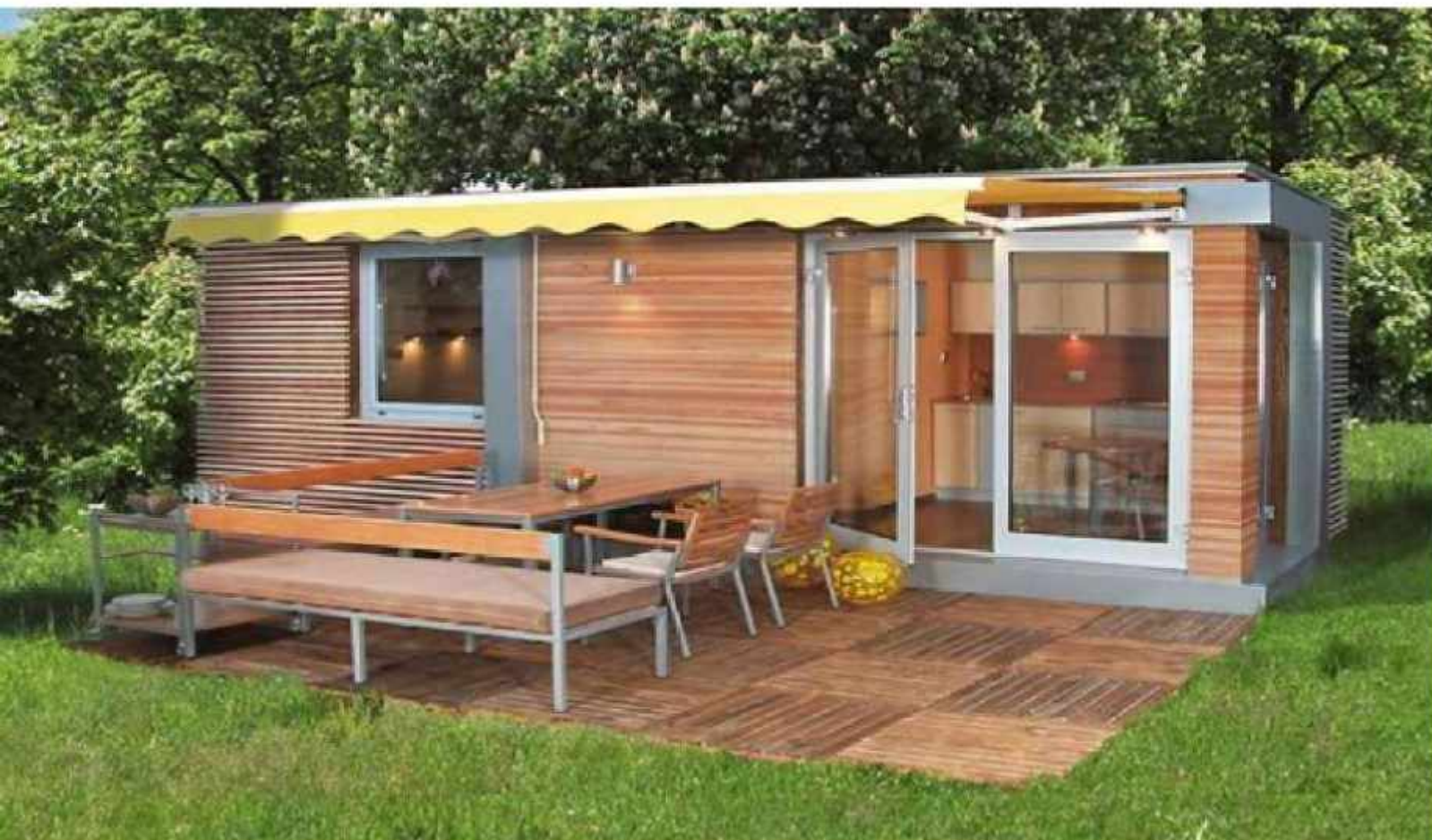
Prefabricated house Bungalow B18

Universal type camping bungalow, container type. The roof is inclined, one-sided roof, constructed with metal or bituminous roof tiles. The total area of the bungalow is 18 m 2 . Containing dining room with kitchen area, bedroom and bathroom with toilet.