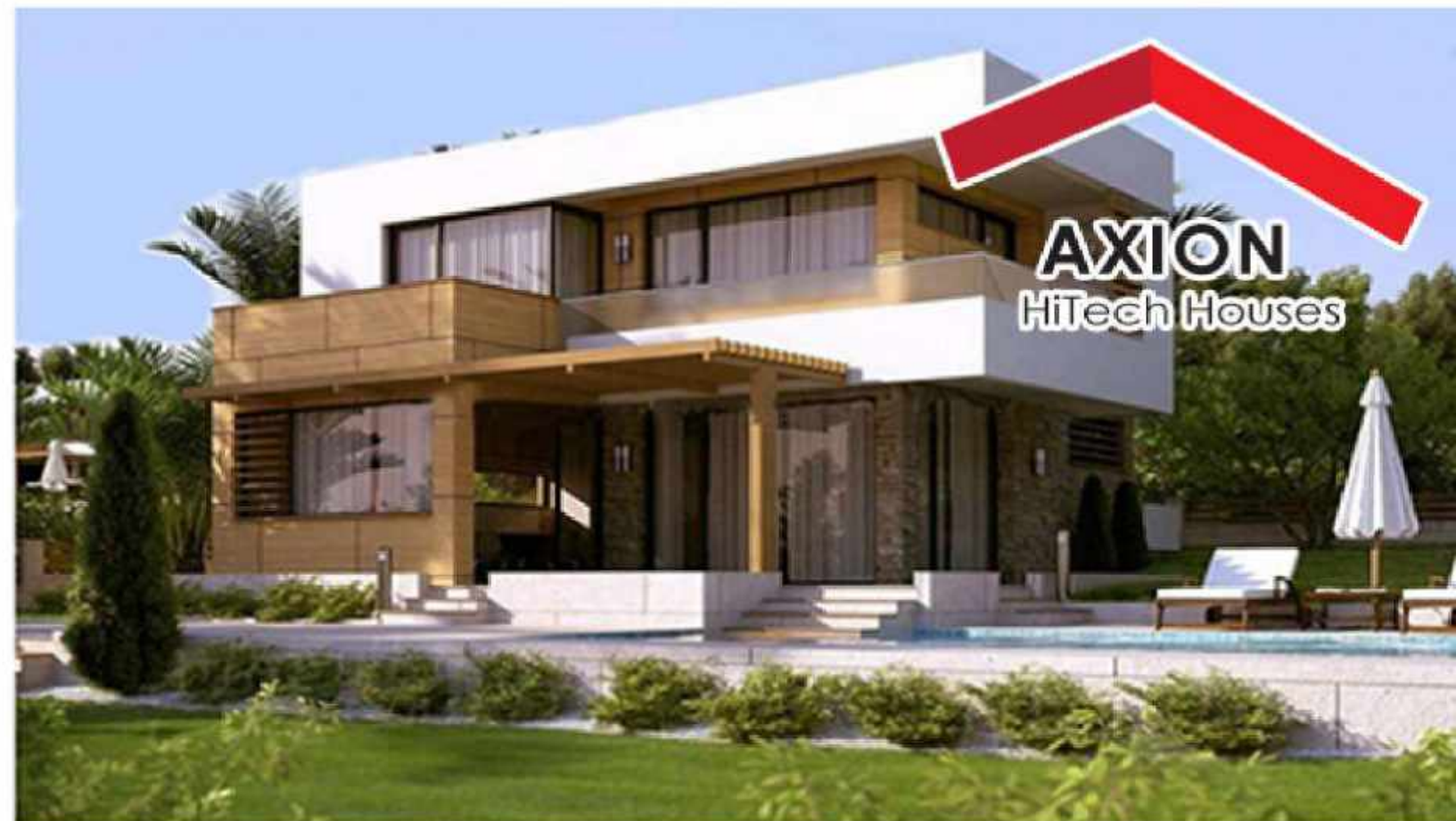
Prefabricated house K 131

Universal prefabricated, two floors house. The roof is inclined, one-sided roof, constructed with metal or bituminous roof tiles. The total area of the house is 131 m 2 for both of the floors.