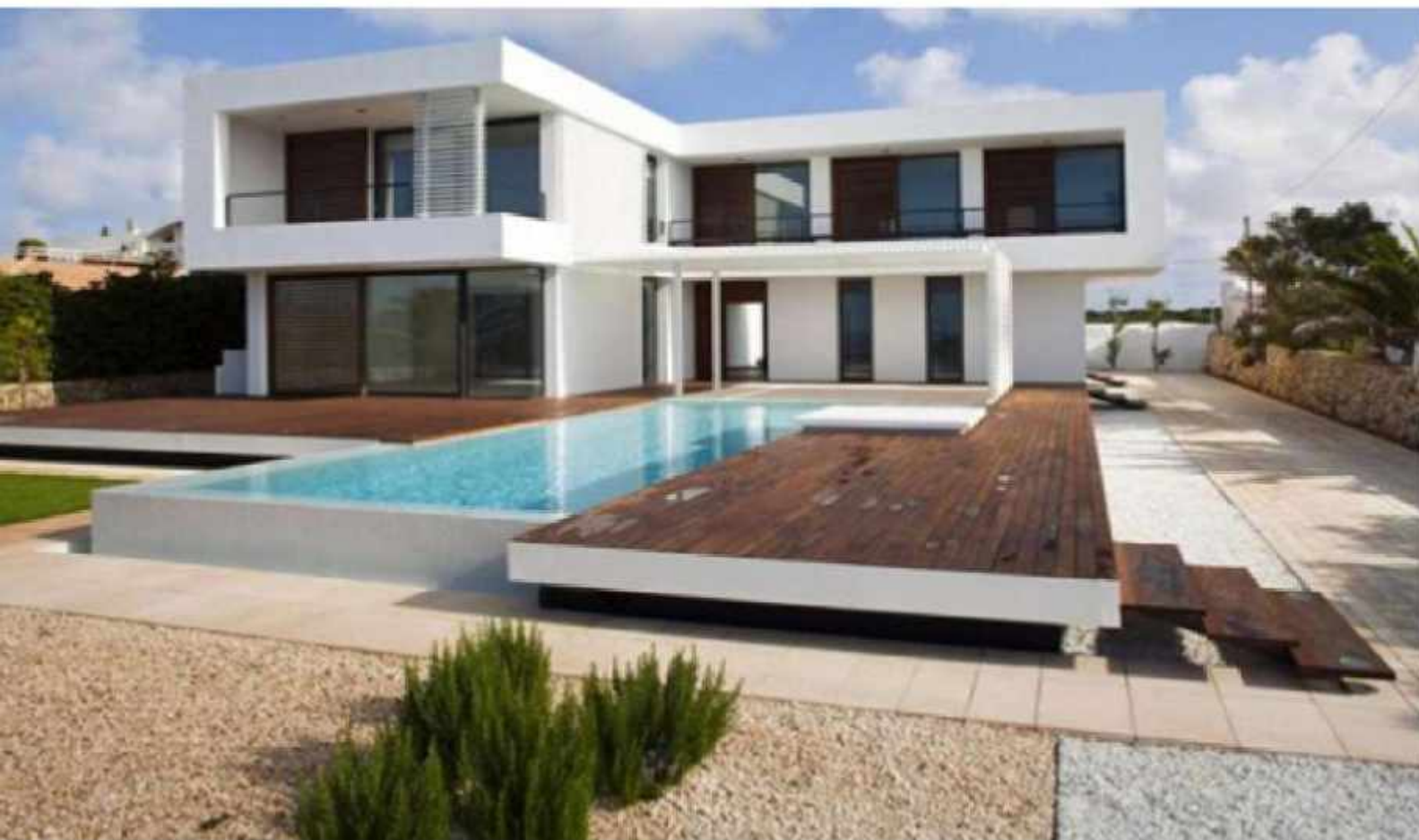
Prefabricated house K 335 luxury