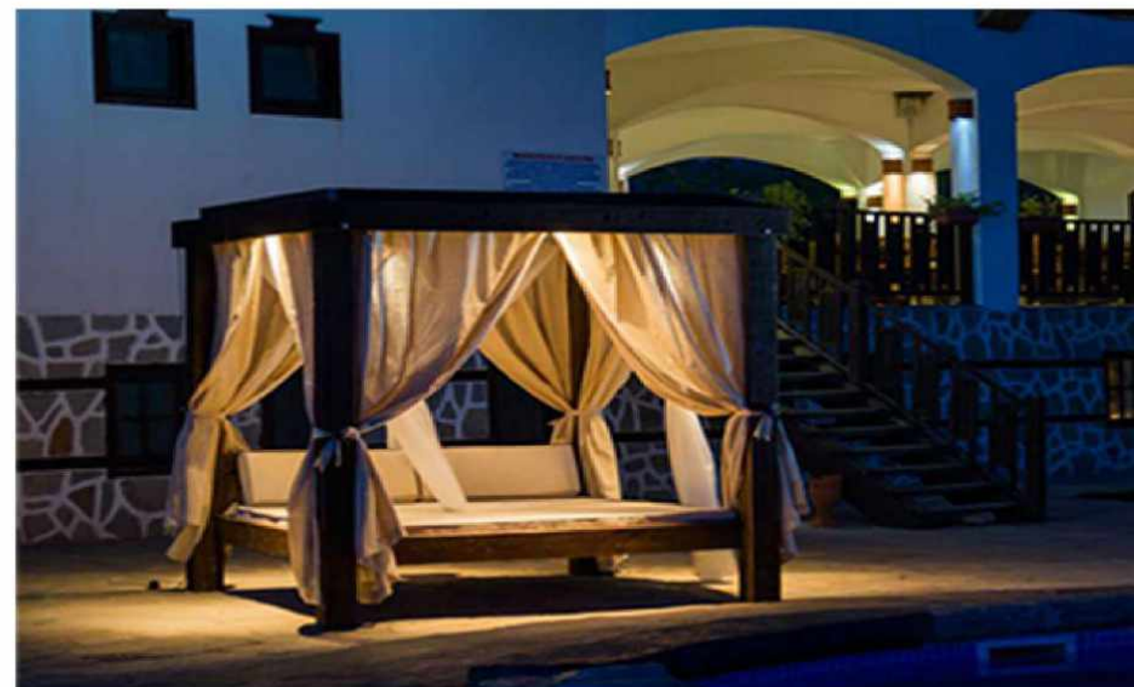
Summer garden - luxury zone