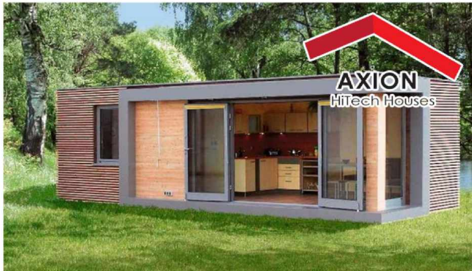
Prefabricated house Bungalow B25

The assembling will be upon the substructure or supporting grid.